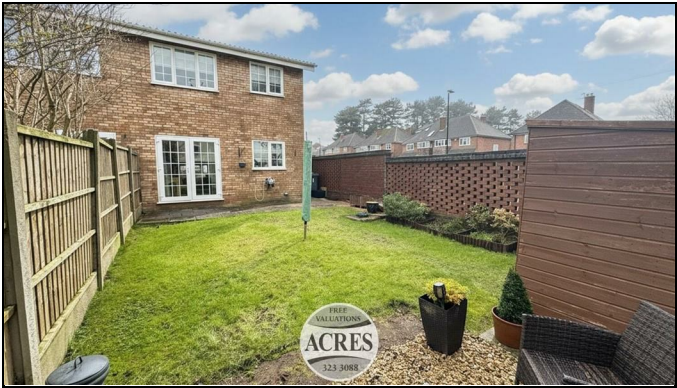
Walcot Close, Sutton Coldfield, B75 5EF